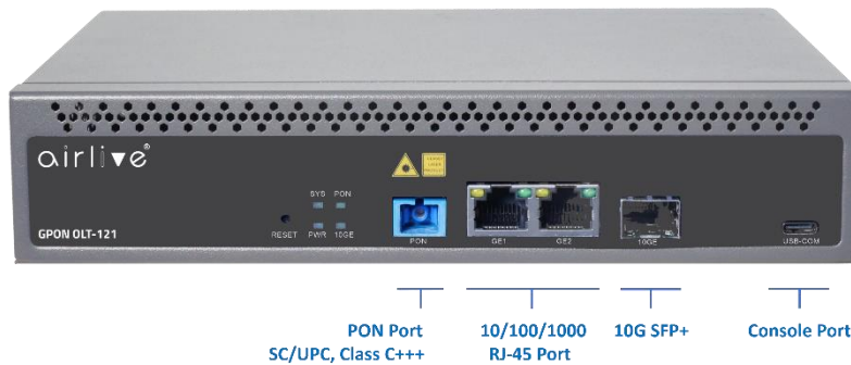
Figure 4 Interface/button Panel