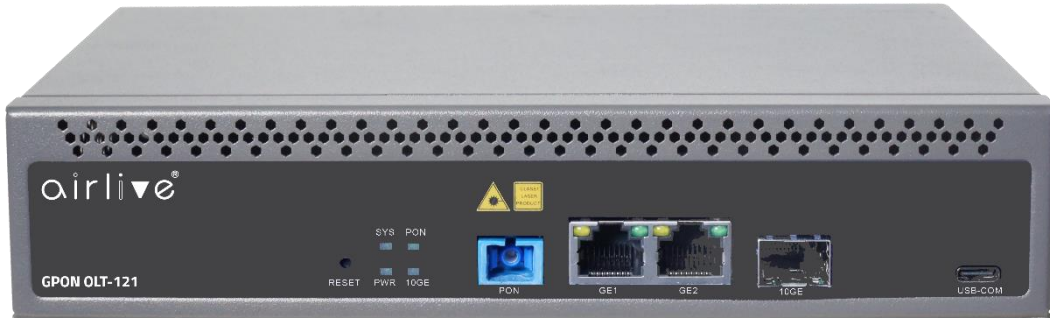
Figure 1 GPON OLT-121